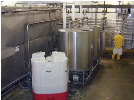
Reliable capacity paced with production flow. External CIP Solution Center conserves utilities.