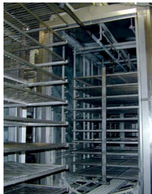
Overhead rail rack washer