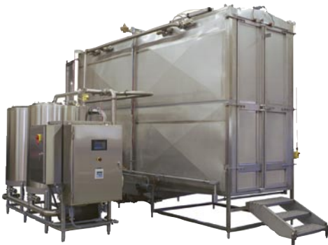
Remote Solution Center eliminates pit

Spray manifolds oscillate to provide effective coverage on all surfaces from all angles.