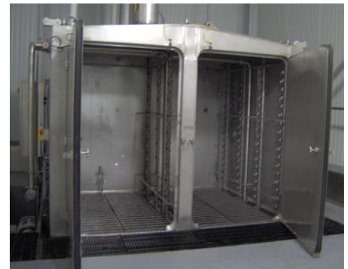
Floor truck washer