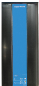
Wall mounted cabinet includes a booster pump. Each can supply 3 - 4 RFS Stations simultaneously.