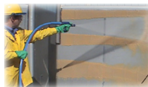
Exclusive nozzle creates a wider, more uniform spray pattern that allows fewer passes to clean a surface area.

View a video of the RFS in action: www.sanimatic.com/products_centralPressure.asp