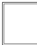
Pillow: 50mL to 200L

klave-it™ bags are made from a select Kynar® PVDF film that is designed to maintain flexibility, strength and impact resistance after sterilization by autoclave. Because the film is a fluorinated polymer, klave-it bags offer superior chemical resistance and low TOC (total organic carbon) content.